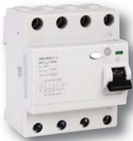
1492-RCD Residual Current Devices